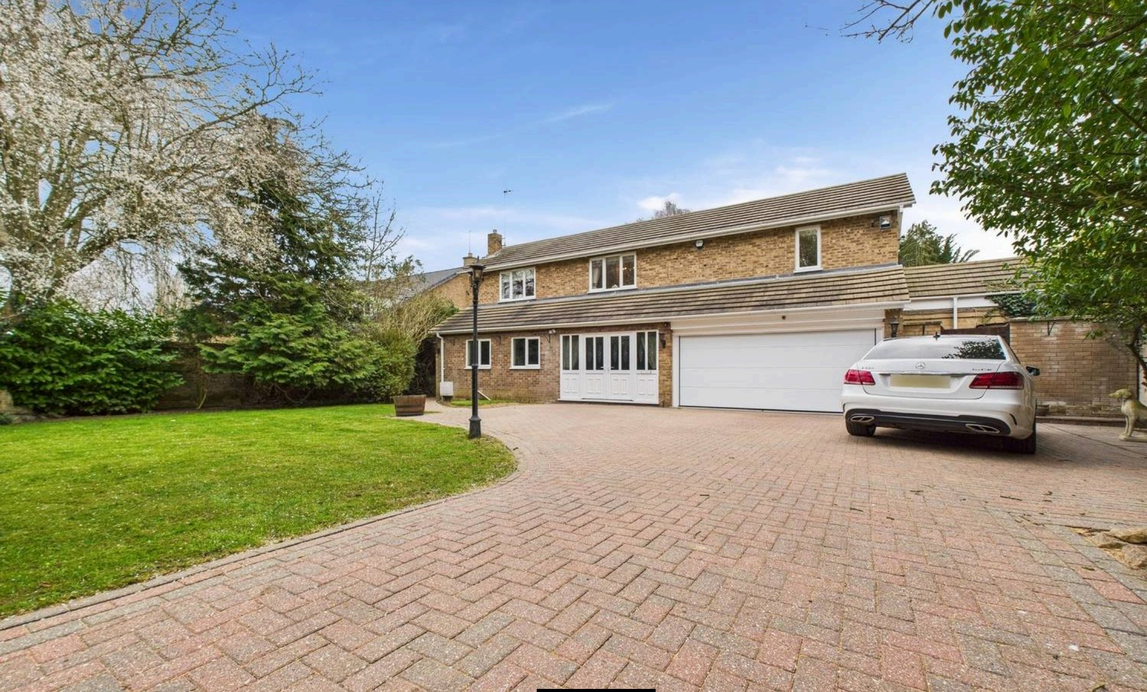
6 Debdale, Orton Waterville Peterborough