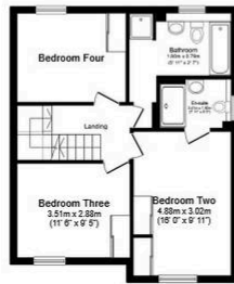
First Floor Floor area 52.0 m 2 (560 sq.ft.)