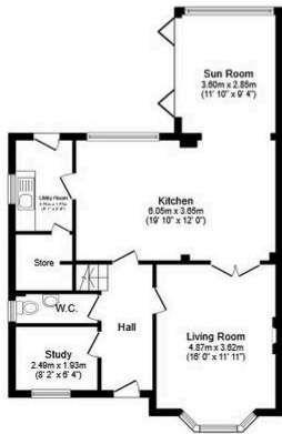
Ground Floor Floor area 73.4 m 2 (790 sq.ft.)