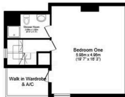
Second Floor Floor area 39.5 m 2 (425 sq.ft.)