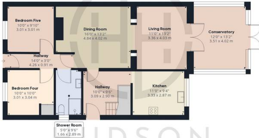
Floor 0 Building 1