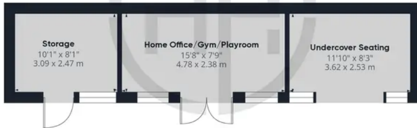
Floor 0 Building 2